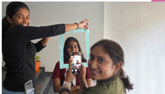
Through the Lens Program

The Centre designs and hosts capacity building programs that introduce participatory, process-oriented teaching-learning approaches, and curates learning resources relevant for higher education.