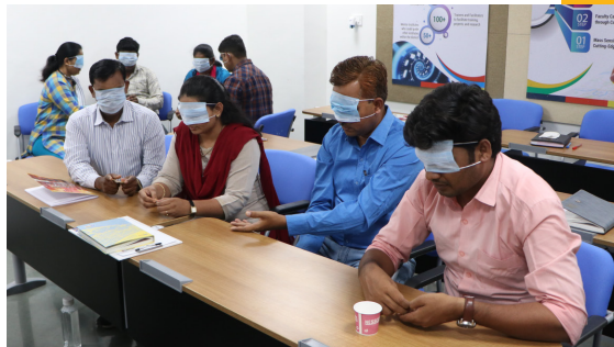
Photo of Understanding Inclusion and Diversity

St. Xavier's Resource Centre for Visually Challenged, Mumbai