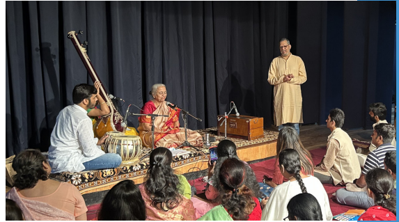
Lalit kala Kendra

This Centre designs and facilitates programs that introduce and appreciate multidisciplinary approach in higher education.